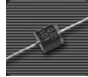
R-6 or P600