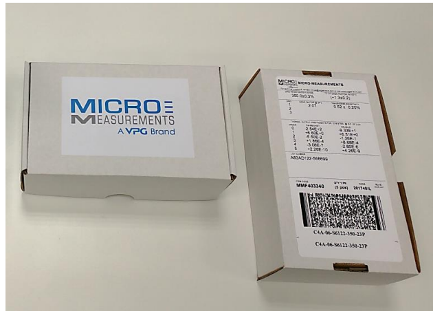
Engineering data is on the backside label